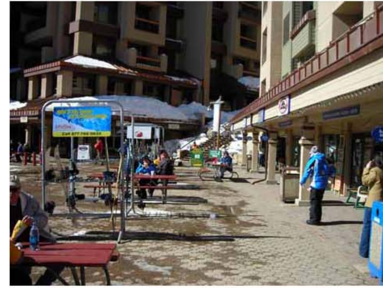
Base Lodge & Bar